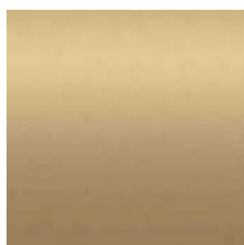
Ottone spazzolato Brushed brass