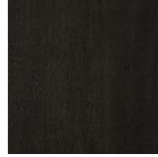
Noce brown Walnut brown