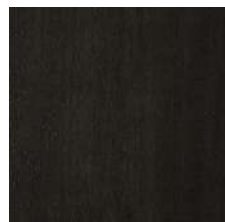
noce brown walnut brown