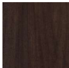
noce moka walnut moka