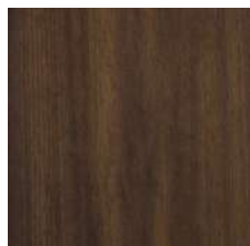
noce dark walnut dark